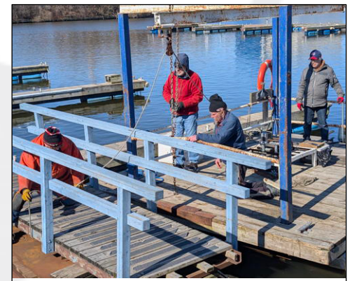
Placing the dock bridges

Thanks to everyone who have been working hard on the back bathrooms and prepping for the new flooring in the clubhouse, things are progressing well and the floor looks great. 🚩