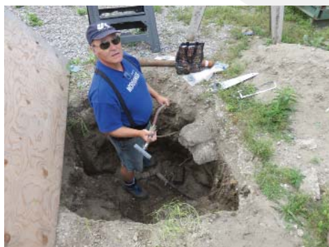
Fixing the water pipe