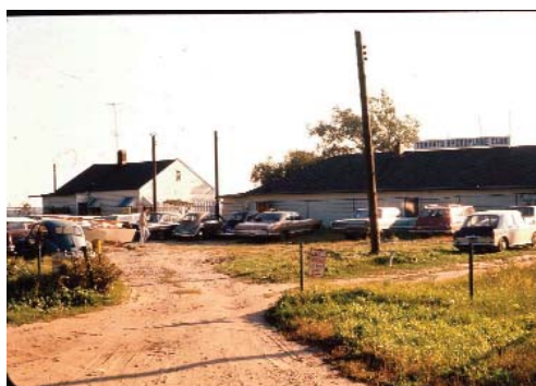
East side of clubhouse— 1960s. Boardwalk ended at this road