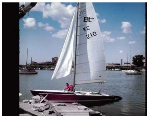
Big boat—small dock