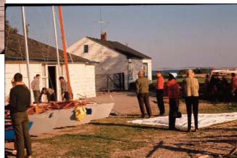
Note what is beyond the far fence—one boat ramp then water