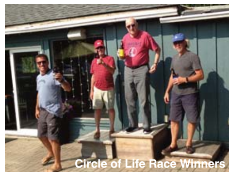
Circle of Life Race Winners

Look forward to seeing you all at haul out.