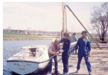
North end of Ashbridge's Bay Note far shore