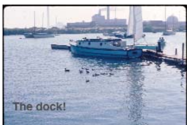
A longer dock