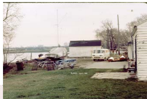
Toronto Hydroplane Club—1966