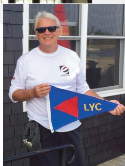
BOTTOM: Lunenburg Yacht Club burgee