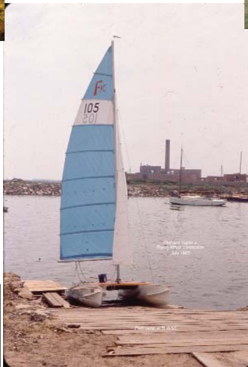
Ramp is built of old boardwalk. Note “long” dock and no trees on west shore—1966