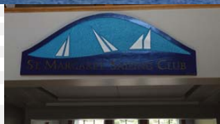
TOP & CENTRE: St. Margaret Sailing Club