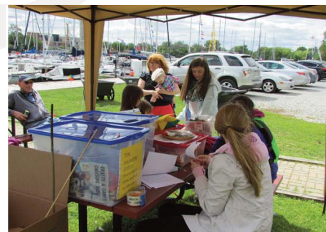
"Kid Wranglers" looked after the little ones while parents had a good time.