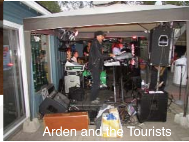
Arden and the Tourists