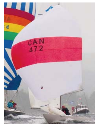
Handsome Jack in Nova Scotia