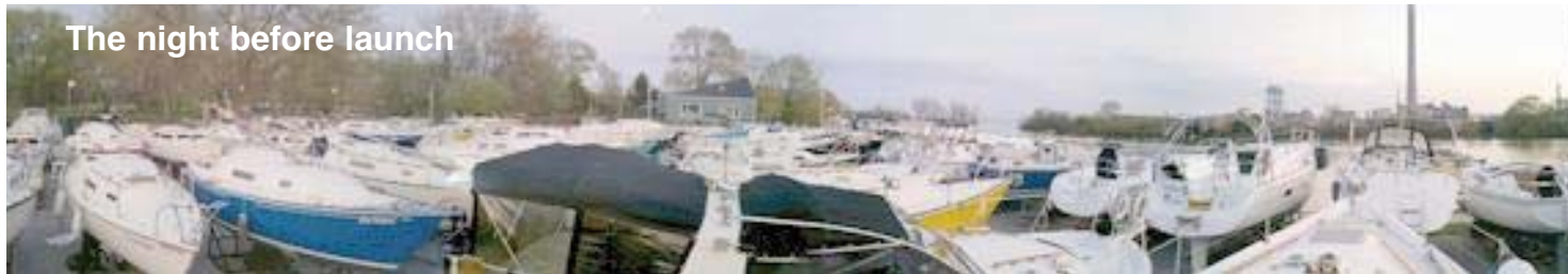
The night before launch