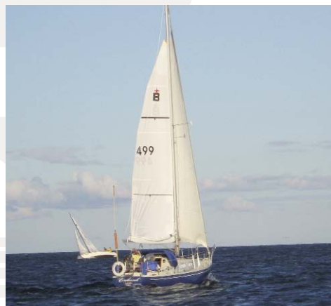
Crackerjack after the rounding